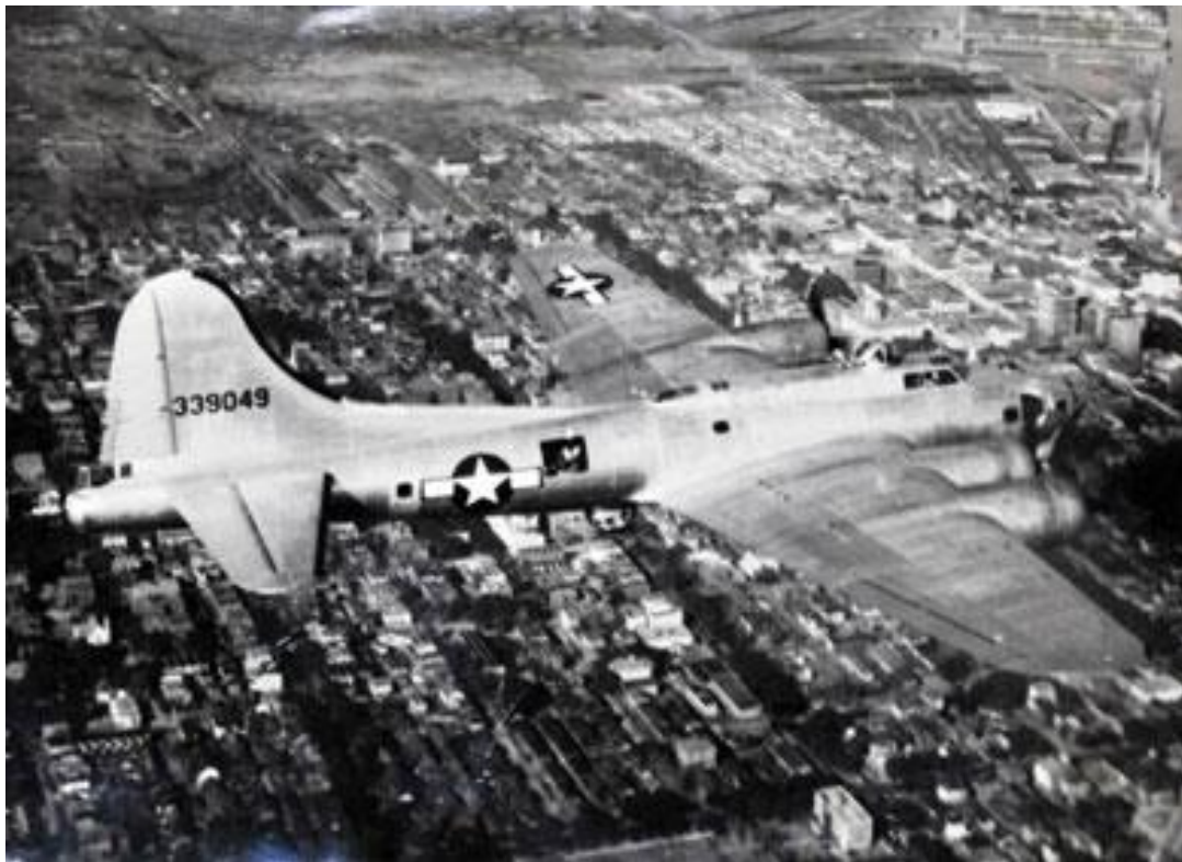
B-17G 43-39049 in flight before it was assigned to the 487 th Bomb Group