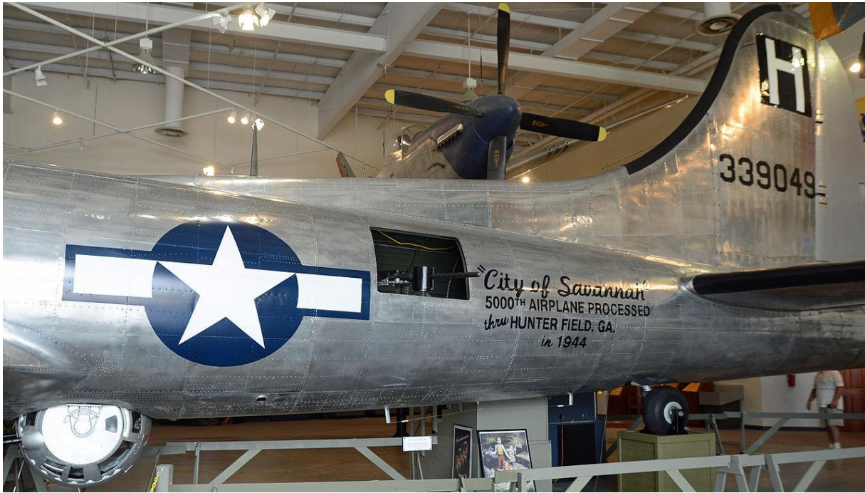
The new 'City of Savannah' on display at the National Museum of the Eighth Air Force, displaying the 'Square H' of the 388 th Bomb Group.

Authored by Ivo M. de Jong, January 2017